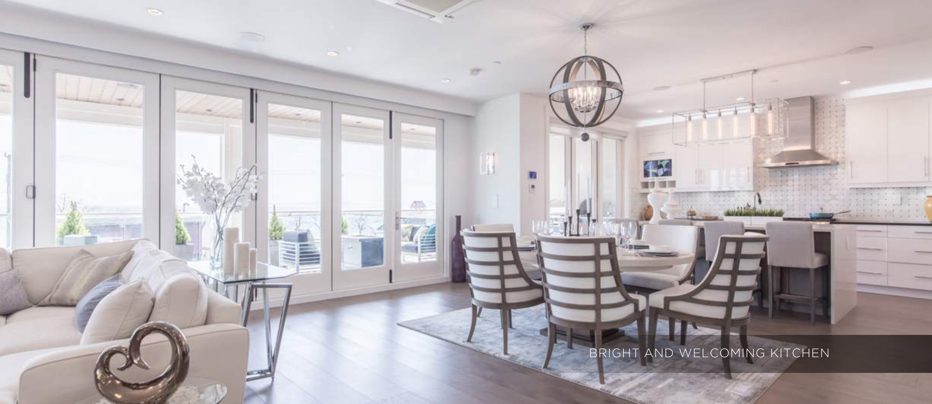
BRIGHT AND WELCOMING KITCHEN