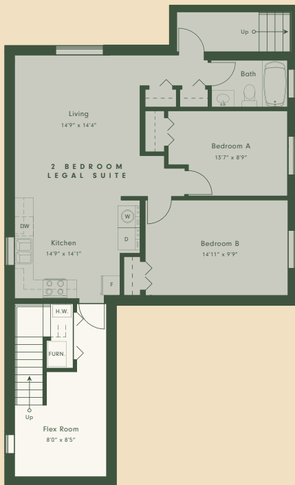
BASEMENT LEVEL 1,019 SQFT 2 BED LEGAL SUITE 800 SQFT